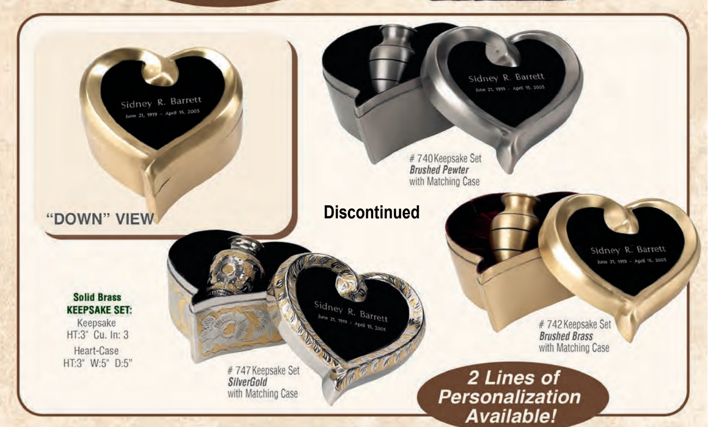
© Elegante Brass Company Urns: U.S. Copyright / "Heart-Keepsake Case": U.S. Patent